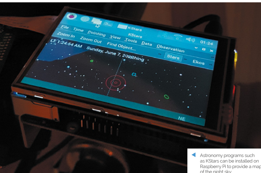
◀ Astronomy programs such as KStars can be installed on Raspberry Pi to provide a map of the night sky

AstroCam can also take multiple exposures automatically, and capture RAW image files – both important capabilities for astrophotography.