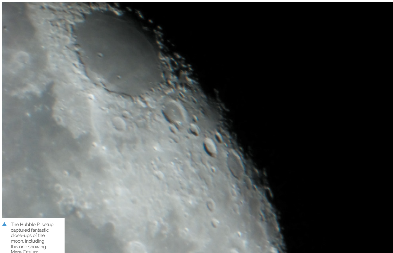
▲ The Hubble Pi setup captured fantastic close-ups of the moon, including this one showing Mare Crisium